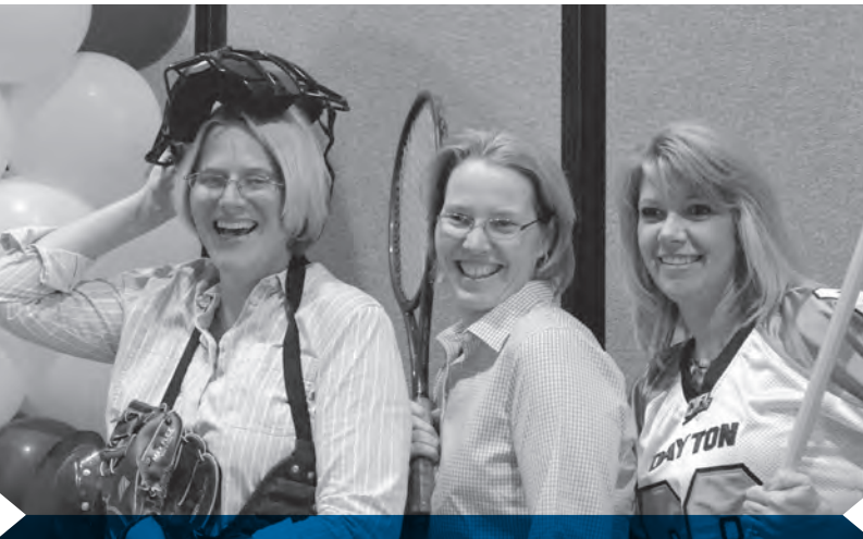
Celebration guests get their game gear on at the Photo Booth.