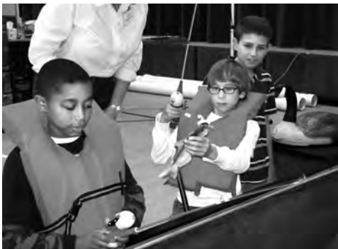
Students explore the natural world when COSI on Wheels visits Springer.

Springer thanks the members of the 2010-11 SPA Executive Board, and each parent who contributed this year to The Springer Experience, through SPA or in other ways.