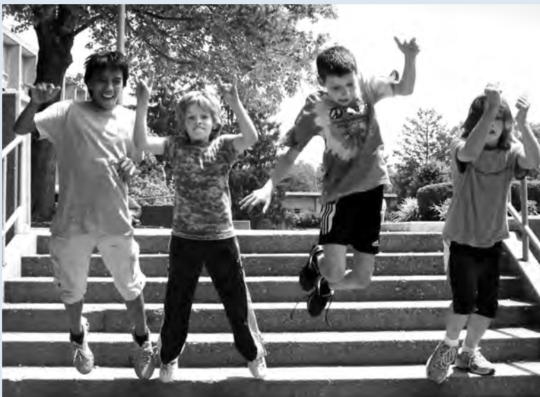
Springer's 5th/6th grade 400 meter relay team.

COMMENCEMENT is an exciting time for students transitioning to new schools.