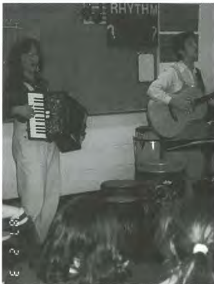
Prairie Orchid entertains students with a variety of musical instruments.