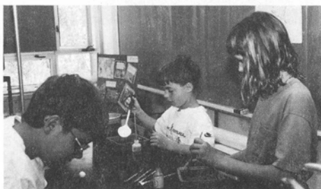
Making "fossils" takes a lot of concentration

An activity everyone loved was actually making fossils. First, the students made molds from seashells and clay. Next, they painted them with soap and then added plaster of paris, thus producing a cast. When the children went to Caesar's Creek on a field trip they knew exactly what they were looking for when they hunted for fossils because of the work they had done making fossils themselves.