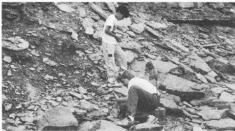
These young scientists knew exactly what to look for as they dug for fossils at Caesar's Creek.

The Intermediate Blue Department worked all year on an exciting, interdisciplinary unit focused on dinosaurs. Every teacher in the Department used the dinosaur theme to introduce and reinforce information on this subject. Teachers and students alike were extremely enthusiastic about all their activities and accomplishments. Every part of the program was influenced by dinosaurs.