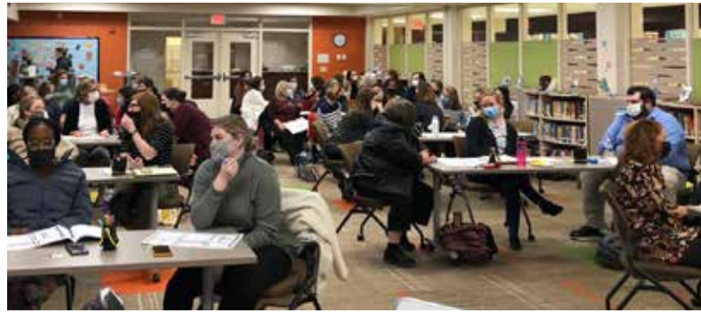
Pictured: Professional development for Springer faculty.