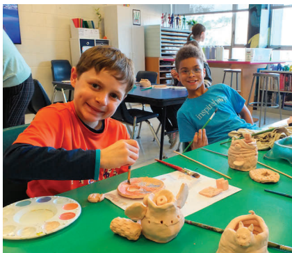
> Glazing fired clay in ceramics