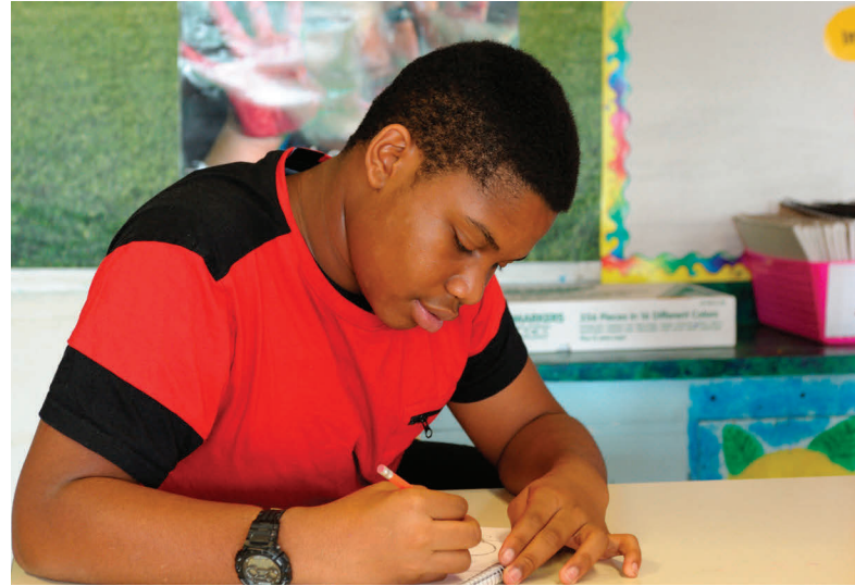
Adventures in Summer Learning is offering courses for high-school age students this summer!

Morning Expeditions, Activity Club and mini camps are the main attractions for children in grades one through five, who have many options for how to build their camp days. Morning Expeditions is the academic component of the day lasting from 8:30 a.m. to 12:30 p.m. and including proven instructional programs like Wilson® and Vmath™. In the afternoon many children stay for lunch and attend Activity Club, formerly called Fun With Friends, which is a social and activity-based learning experience to compliment the morning. Mini camps are add-on opportunities to dive into