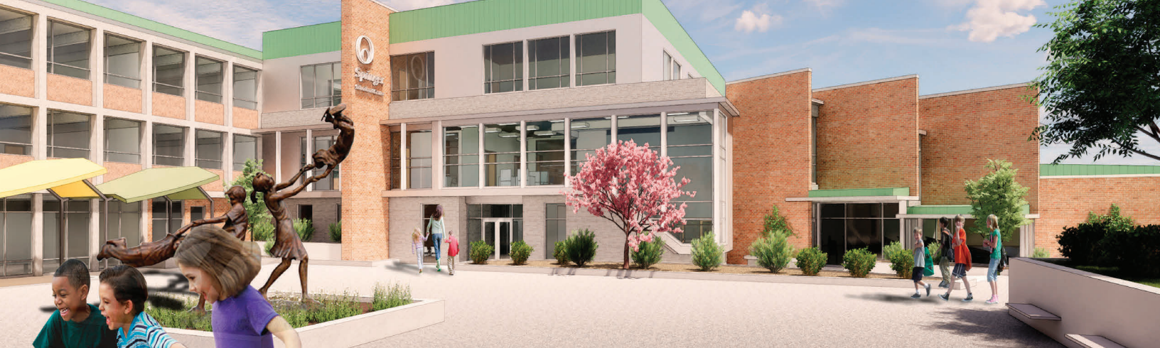
> Above: Rendering of projected enhancements for illustration purposes. Renovation may differ.