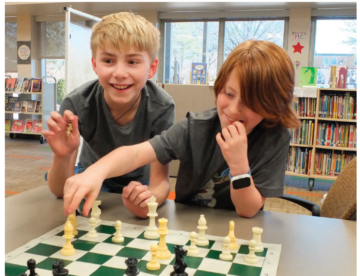
> Lower School students devise an attack during chess club.