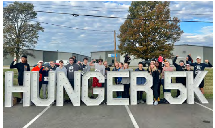
Running Club participating in the Hunger 5K in Blue Ash on November 4

Midway through the day, Quest class provides instruction and experiences that help build self-awareness, explore college and career paths and develop a clear plan for their future. Goal setting, service-learning and technology tools are all components of this unique class that prepares students for the next phase of their development. Ninth graders visited